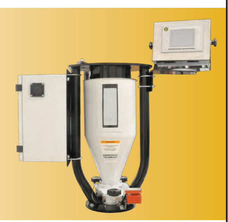
The HG Series 2: The precise weigh hopper component of an integrated Gravitrol® system

Designed for use as part of the Gravitrol® system, the HG Series 2 Weigh Hopper incorporates engineering and design breakthroughs to help achieve the optimal result in extrusion: a uniform product within tolerance at the lowest possible manufacturing cost.